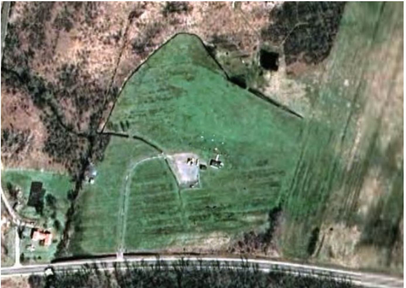
STARS Field Satellite photo